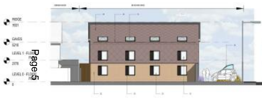
C NORTH ELEVATION 1:00