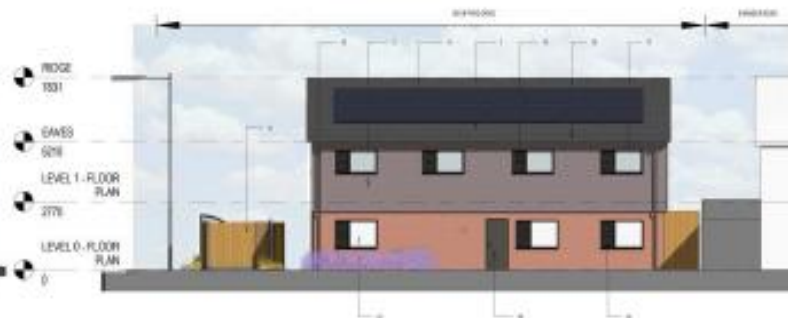
D SOUTH ELEVATION 1:00