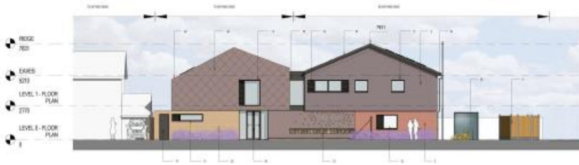
A WEST ELEVATION 1:00